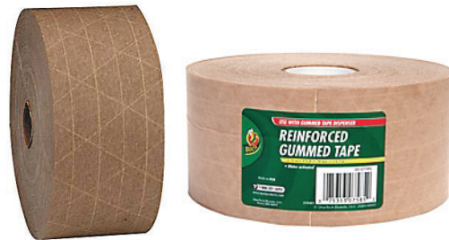
▲ Examples of water-activated paper packaging tape. Varieties are available at your local Staples, Office Depot, or other office supply store.